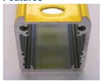
Rugged closed housing profile: