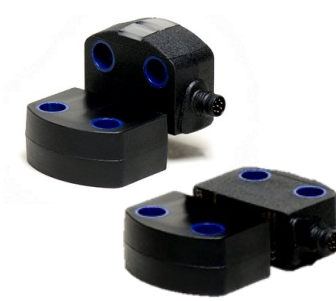
2 actuator approach directions