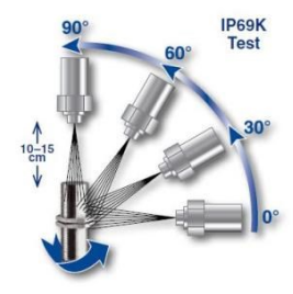
Devices bearing the IP69K rating can be used in applications in which they are exposed to high pressure (1450psi) and high temperature (175°F) wash down