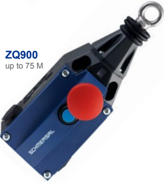
ZQ900 up to 75 M