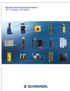
GK-1 Machine Guarding Safety Products Catalog Section 2