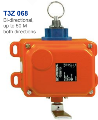
T3Z 068 Bi-directional, up to 50 M both directions