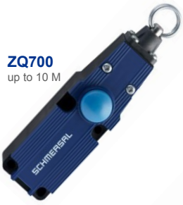
ZQ700 up to 10 M