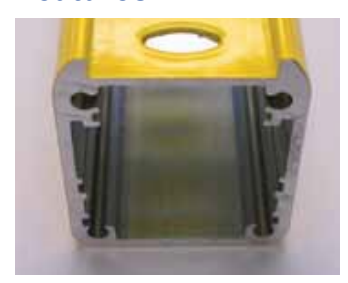
Rugged closed housing profile