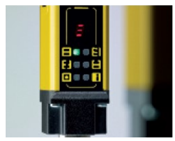
7 segment & LED display